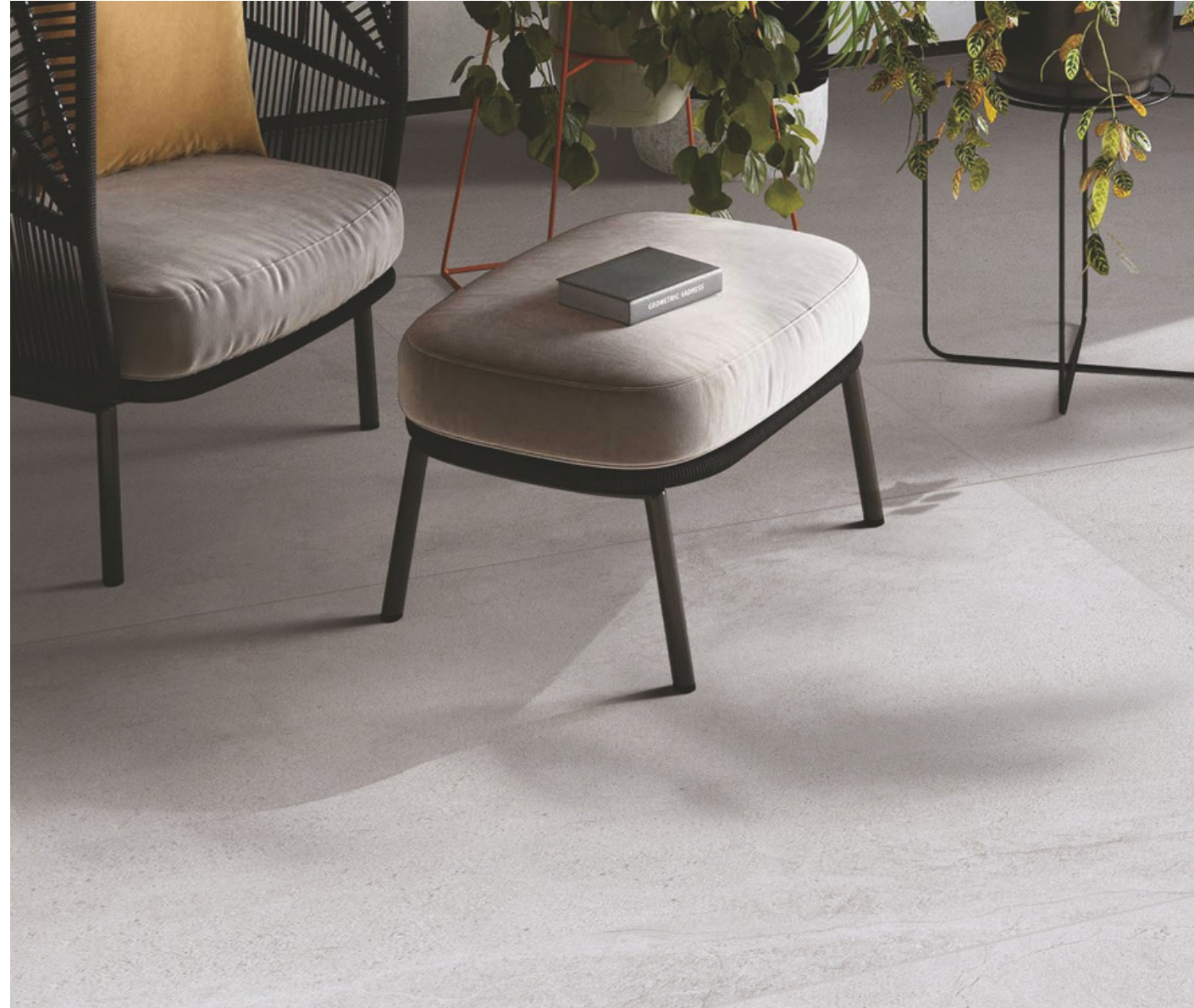
LIDO-LM Floor / Wall / 600x1200/24"x48"