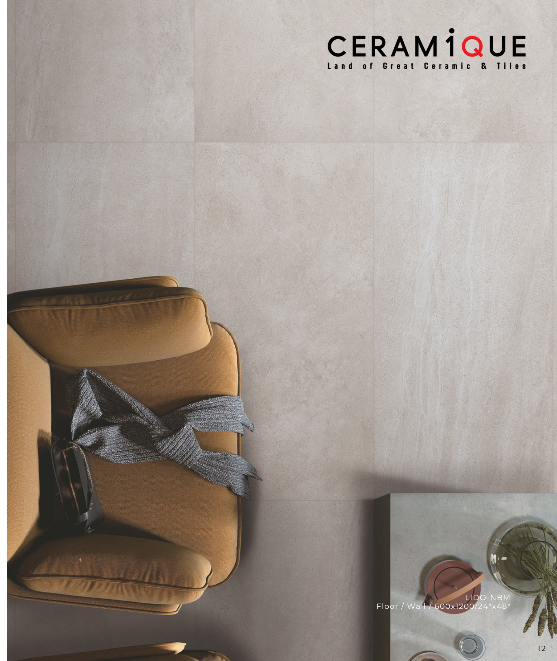
LIDO-NBM Floor / Wall / 600x1200/24"x48"