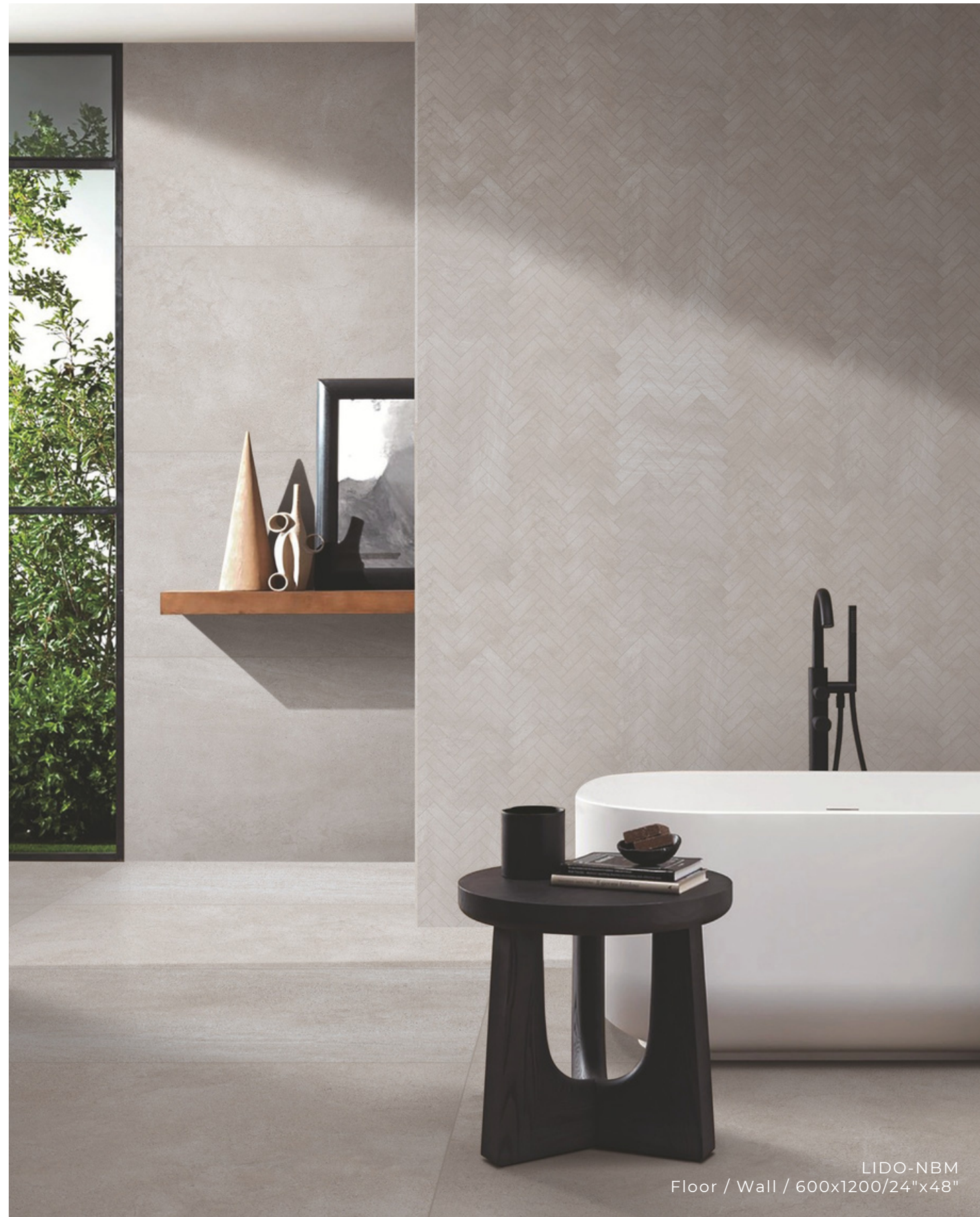
LIDO-NBM Floor / Wall / 600x1200/24"x48"