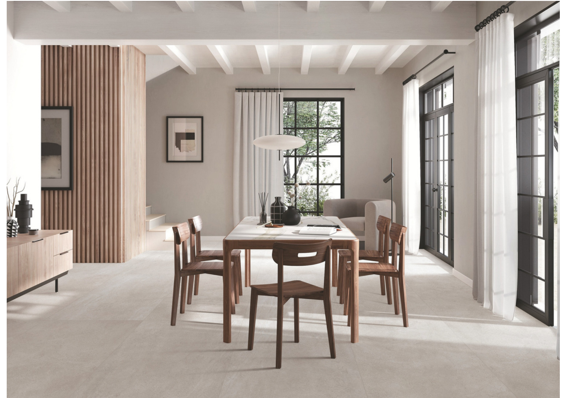
LIDO-NBM Floor / Wall / 600x1200/24"x48"