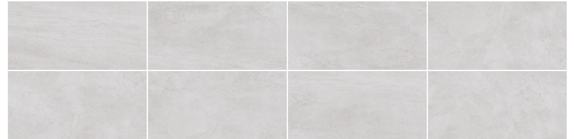
8 different faces